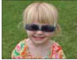
Bibi in sunglasses