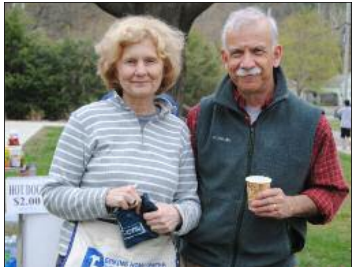
(right) Spring Tag Sale.