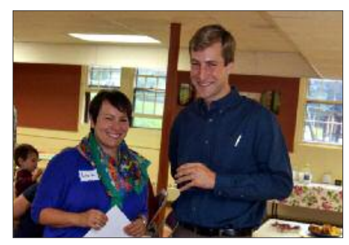
The Sunday School open house