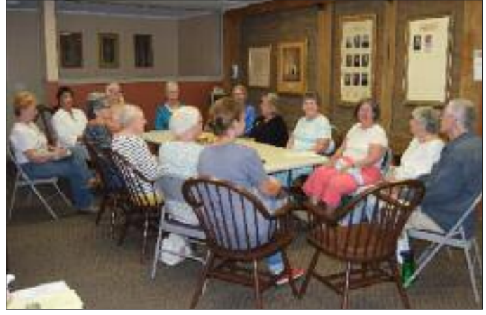
Altar Guild meeting