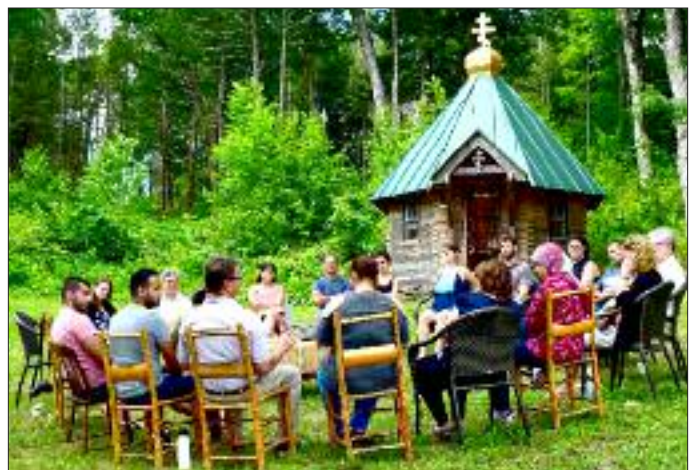
Sunday teaching before worship