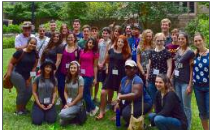
Teens touring Yale University