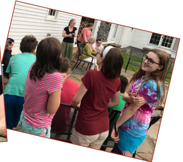
PHOTO FROM PRAY VIGIL