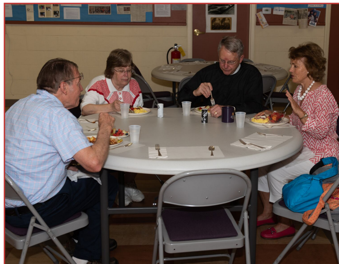
Photo from Community Breakfast on July 15