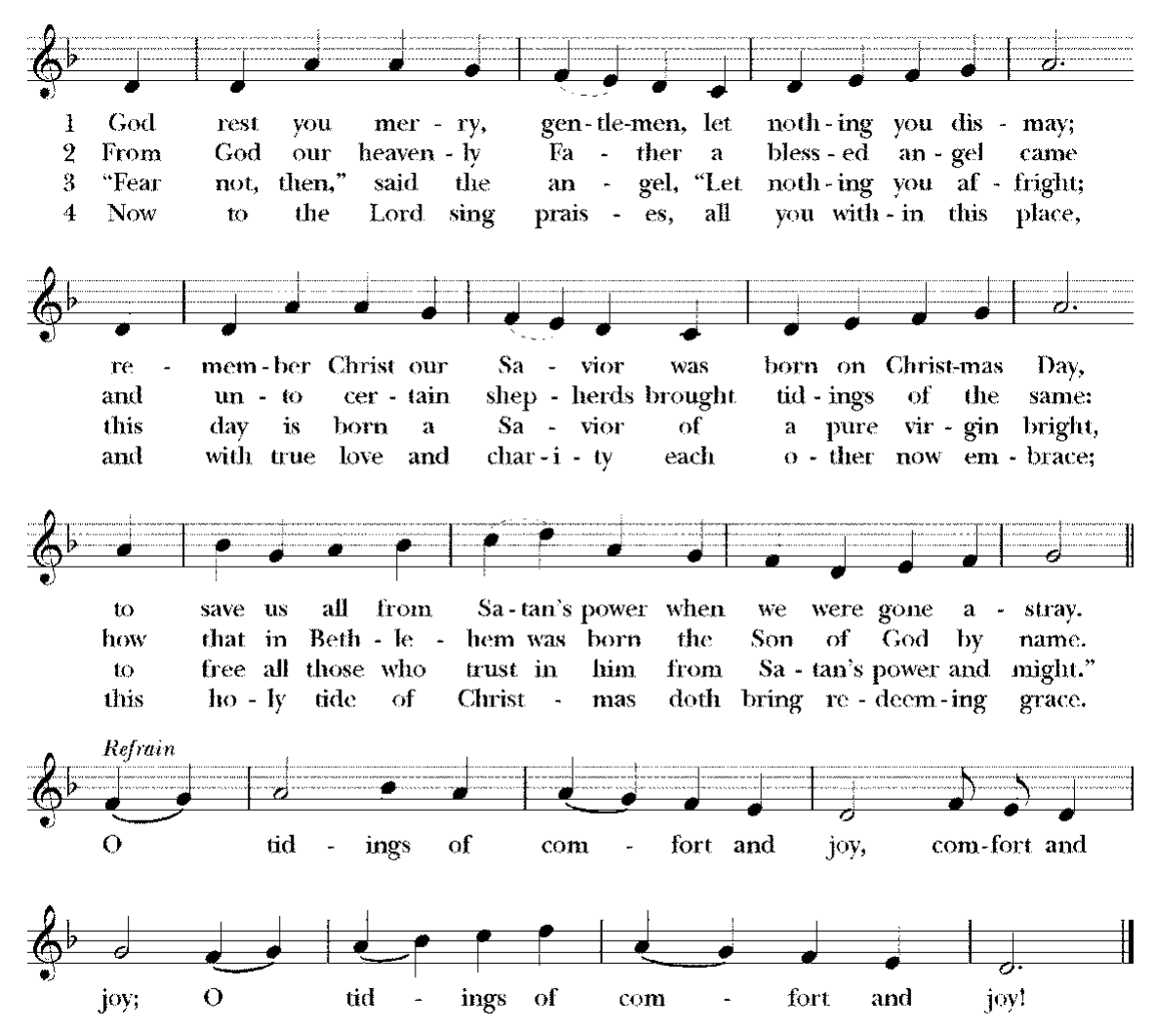
Keyborad and guitar should not sound together.