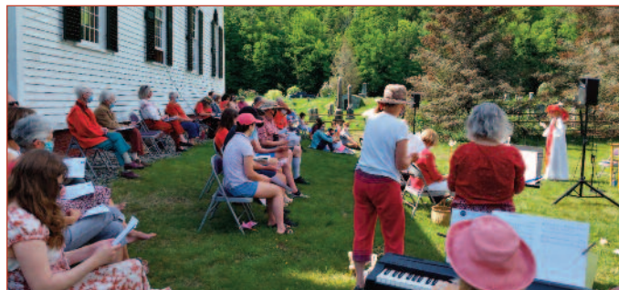
St. Michael's celebrates Pentecost