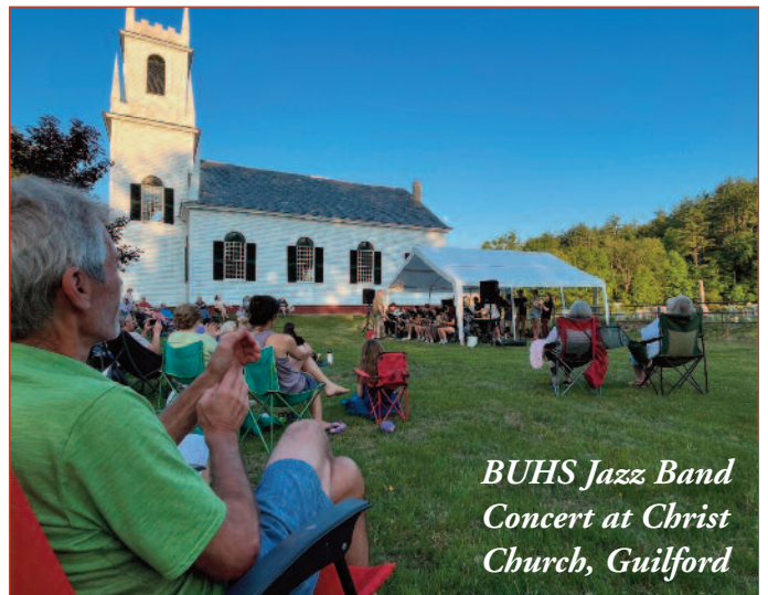
BUHS Jazz Band Concert at Christ Church, Guilford