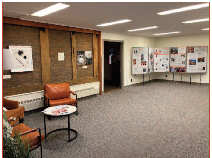
The Completed Common Room.

On November 5, one of St. Michael's carbon monoxide alarms went off, so everyone was evacuated before the 10:15am service. Fortunately, the firemen found no carbon monoxide in the building, it was a beautiful day and the kids really enjoyed seeing the fire trucks!