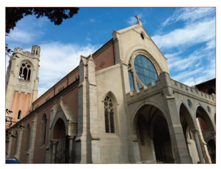
St. James' Episcopal Church in Florence, Italy

Some of you might remember that I had planned a vacation with three of my seminary friends right after the Annual Meeting at the end of January. It had taken my friends and I two years to find dates that would work for all of us to get together. In a series of unfortunate events, I came down with Covid right before I was supposed to leave (the day of the Annual Meeting). I had hoped I might be able to join my friends in Arizona later in the week, but I was not well