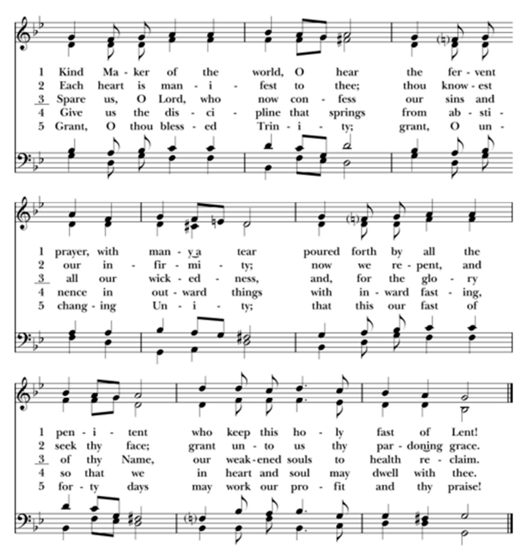
Words: St. Gregory the Great (540-604); ver. Hymnal 1940, alt. Copyright © The Church Pension Fund. Music: A la venue de Noël, melody from Fleurs des noëls, 1535.