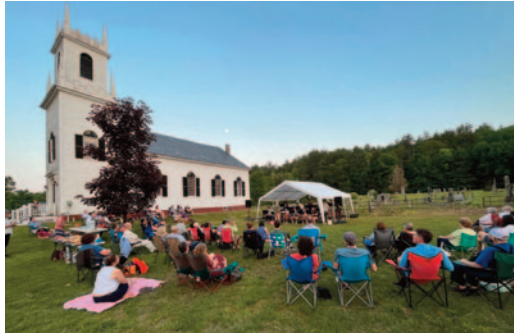
Christ Church, Guilford