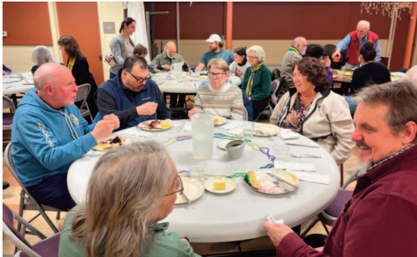
Shrove Tuesday Pancake Supper

If you wish to make a tax-deductible donation to the match for this grant, go to the website of the Christ Church Guilford Society at https://www.christchurchguilfordsociety.org/ .